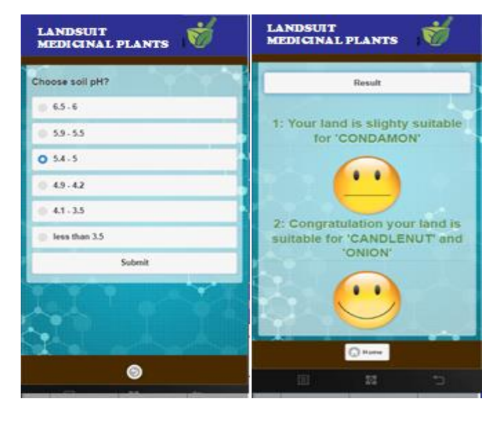
Figure. 2. Soil pH and result of the land suitability evaluation